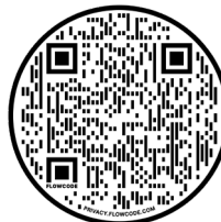
LEARN MORE ON OUR WEBSITE!