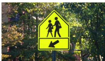
PEDESTRIAN CROSSING SIGNAGE