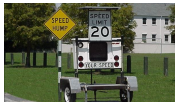
SPEED MONITORING DEVICES