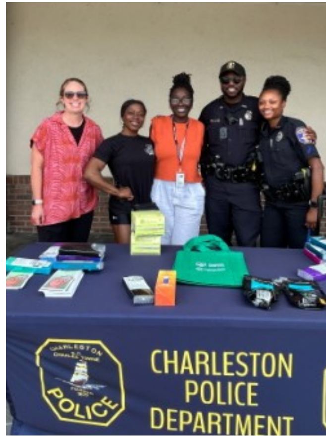
West Ashley Piggly Wiggly CPD and Charleston Center Narcan Distribution