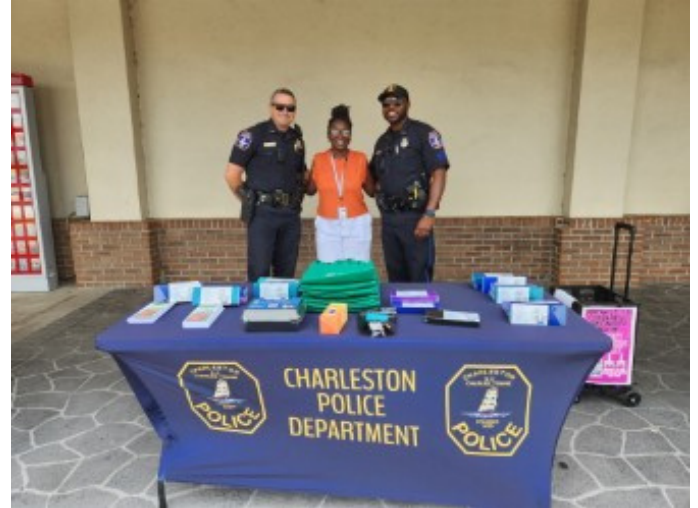
West Ashley Piggly Wiggly CPD and Charleston Center Narcan Distribution