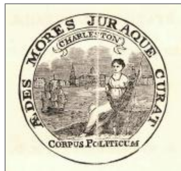
1847 Seal 7

In the years leading up to and immediately following the Civil War we see few significant changes in the design of the seal. This impression from the 1848 Census of the City of Charleston displays updated dress and hair, but otherwise shows no noteworthy differences from earlier depictions.