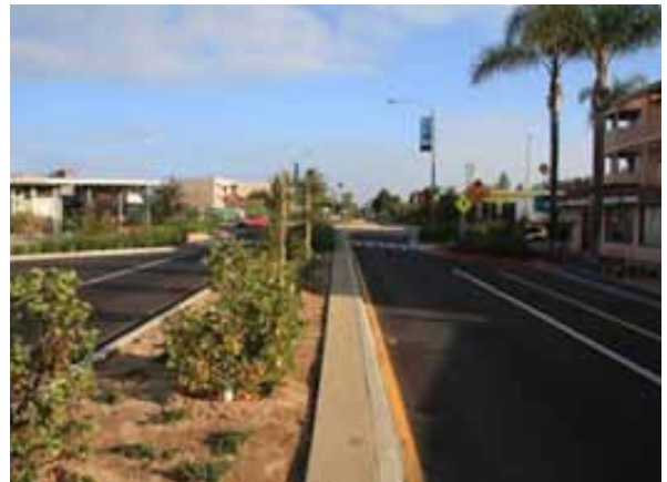
Before (left) and after (right) of La Jolla Boulevard in San Diego, CA