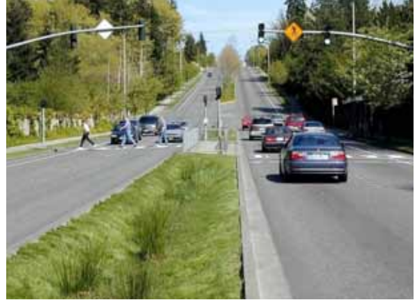
Before (left) and after (right) images of Bridgeport Way in University Place, WA